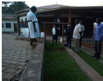
Construction of Tippy tap at Namugongo Church

Midwives Union organized a meeting where nurses were appreciated for their work and Nurses' challenges were discussed and presented to the authorities.