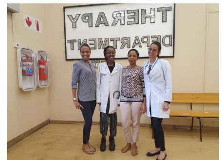
Sample of pictures of students on the GEMx Student Elective Program